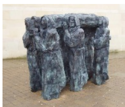
'The Journey'. St Cuthbert's coffin carried by the monks to his resting place in Durham Cathedral. St Mary's Church, Lindisfarne.

In darkness and in light, in trouble and in joy, help us, heavenly Father, to trust your love, to serve your purpose, and to praise your name; through Jesus Christ our Lord. Amen.